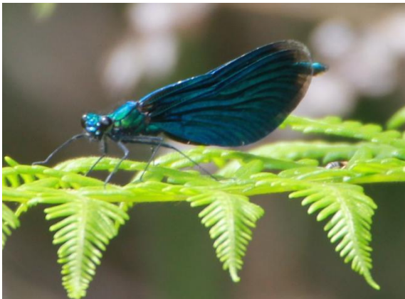
Beautiful Demoiselle

Broadwater Warren is in the High Weald Area of Outstanding Beauty near to Tunbridge Wells. Since taking over the management in 2007, the RSPB has recreated 65 hectares of open heathland by removing