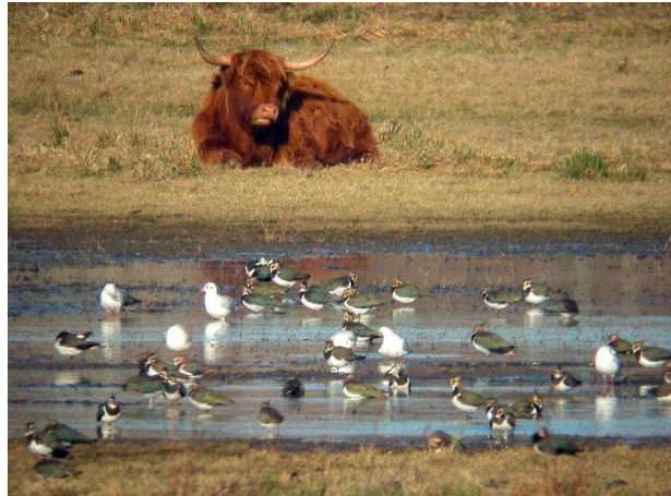
Lapwings, gulls and Highland cattle at Pulborough Brooks

And finally, make a note in your diary or calendar on the kitchen wall, we will be hosting another social evening at our last indoor meeting of year with fun quizzes, prizes to win, time to chat, share photos, drink and eat. We invite you to bring and share cakes – the more the merrier! Thursday 14 th December from 7:30pm , at our usual Northfleet school for Girls venue.