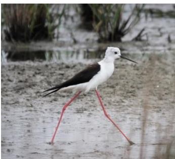
Black-winged stilt